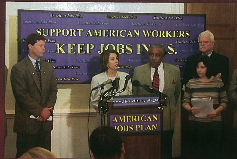
Rep. Pelosi joined Reps. Ron Kind, Charlie Rangel, and George Miller in announcing the American Jobs Plan.

Our economy is at a crossroads. Since January 2001, we have lost nearly 2 million private sector jobs, and as many as 500,000 of these jobs were shipped overseas. According to a recent study by the University of California, 14 million more American jobs will be at risk if we do not act.