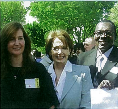
IN WASHINGTON, DC, REP. PELOSI MEETS WITH CITIZENS CONCERNED ABOUT THE SITUATION IN DARFUR.

The recent announcement of a peace accord was a welcome step, but the people of Darfur must not be kept waiting for implementation or for humanitarian aid. I am working with the Congressional Black Caucus to ensure the world community meets the challenge to conscience posed by Darfur.